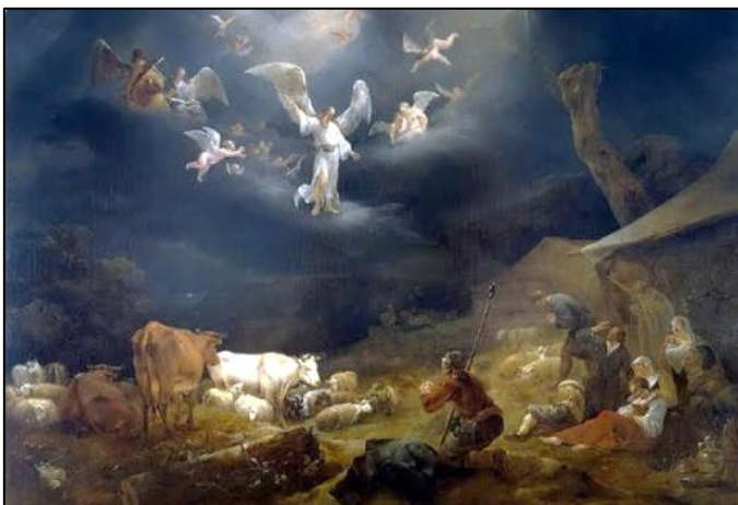
The Annunciation to the Shepherds, by Nicolaes Berchem 1649

In this season of advent, it is impossible not to think of Charles Wesley's, and probably my favourite, Christmas hymn 'Hark the Herald Angels Sing'. This is, of course, based on Luke 2:10-11: 'But the angel said to them, "Do not be afraid, for see, I am bringing you good news of great joy for all the people: to you is born this day in the city of David a Saviour, who is the Messiah, the Lord."'